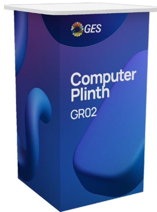
GR02 Computer Plinth