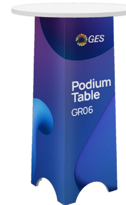
GR06 Podium Table