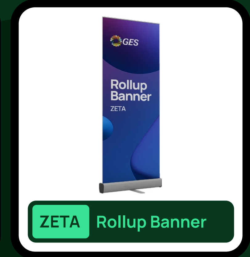
ZETA Rollup Banner

All items printed to order – yours to keep.