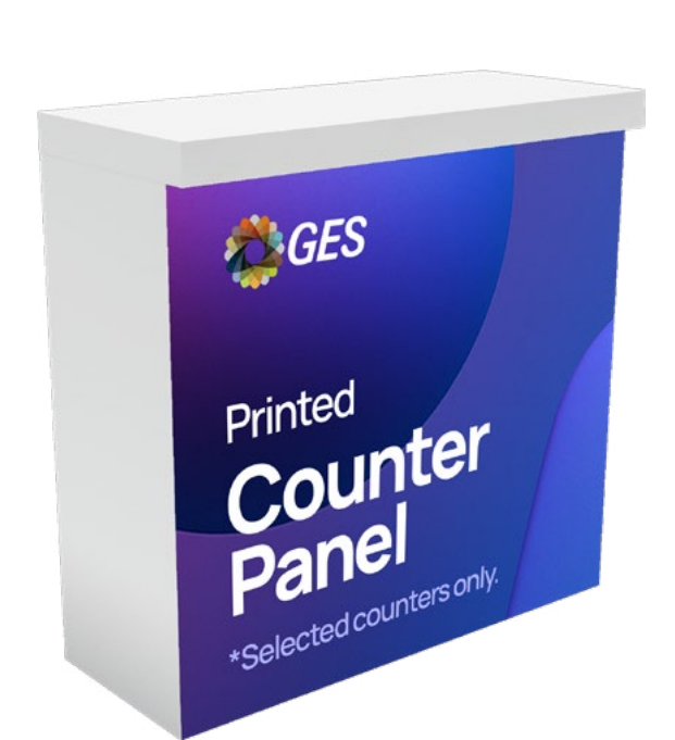
Printed Counter Panel

These custom-printed structures bring dimension to your stand. Whether you need a focal point, a tidy place to demo, or something bold that shouts your brand from across the aisle—we've got options.