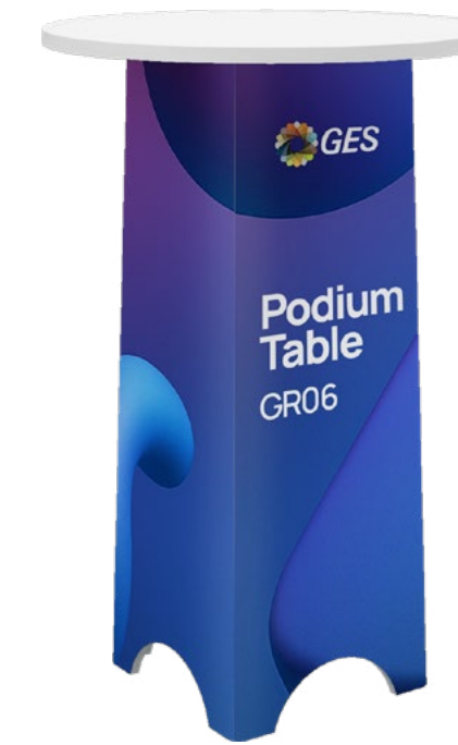
GR06 Podium Table