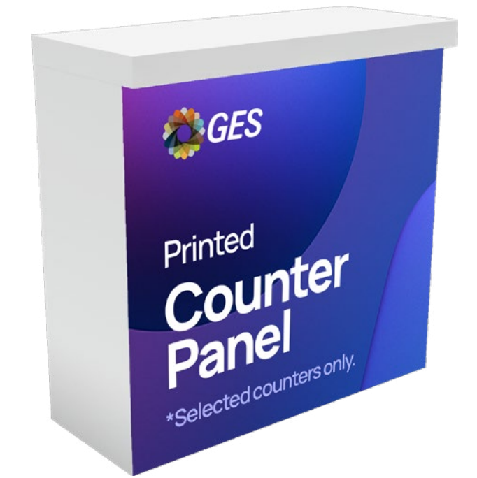
Printed Counter Panel

These custom-printed structures bring dimension to your stand. Whether you need a focal point, a tidy place to demo, or something bold that shouts your brand from across the aisle—we've got options.