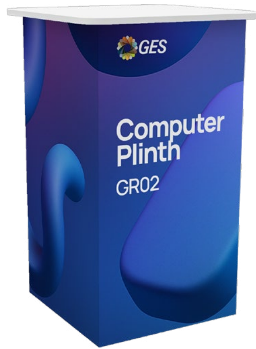
GR02 Computer Plinth