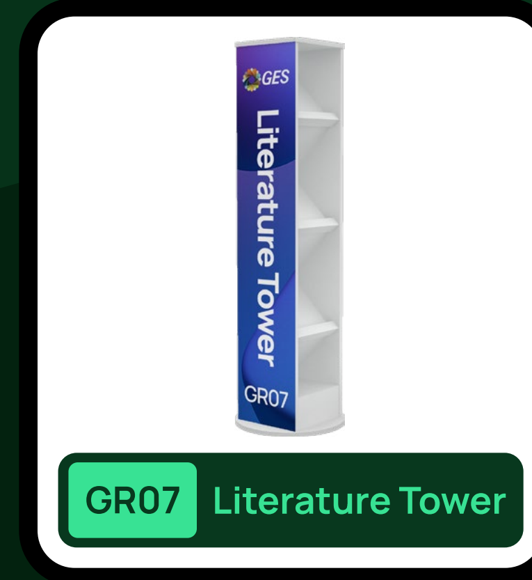
GR07 Literature Tower