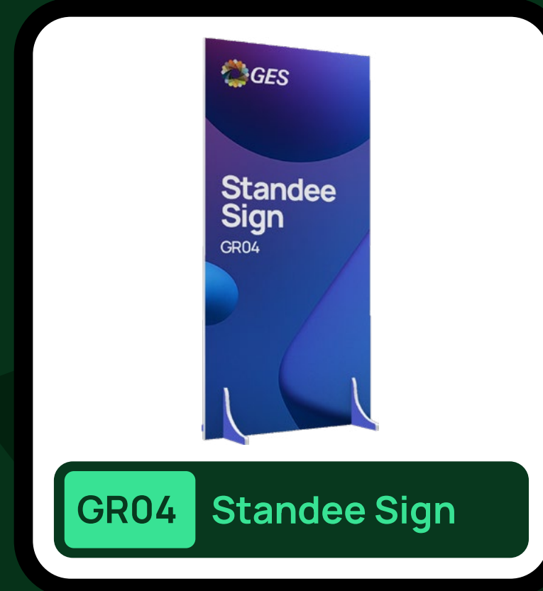
GR04 Standee Sign