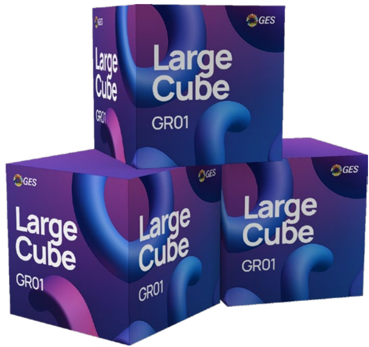
GR01 S/M/L Cube

Add structure and substance to your space