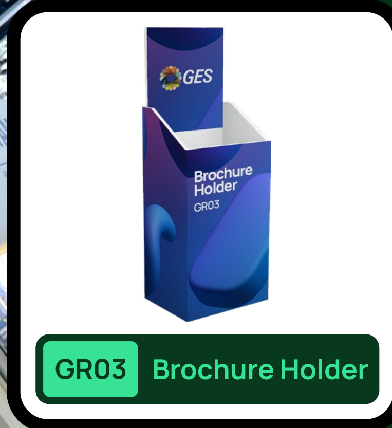
GR03 Brochure Holder