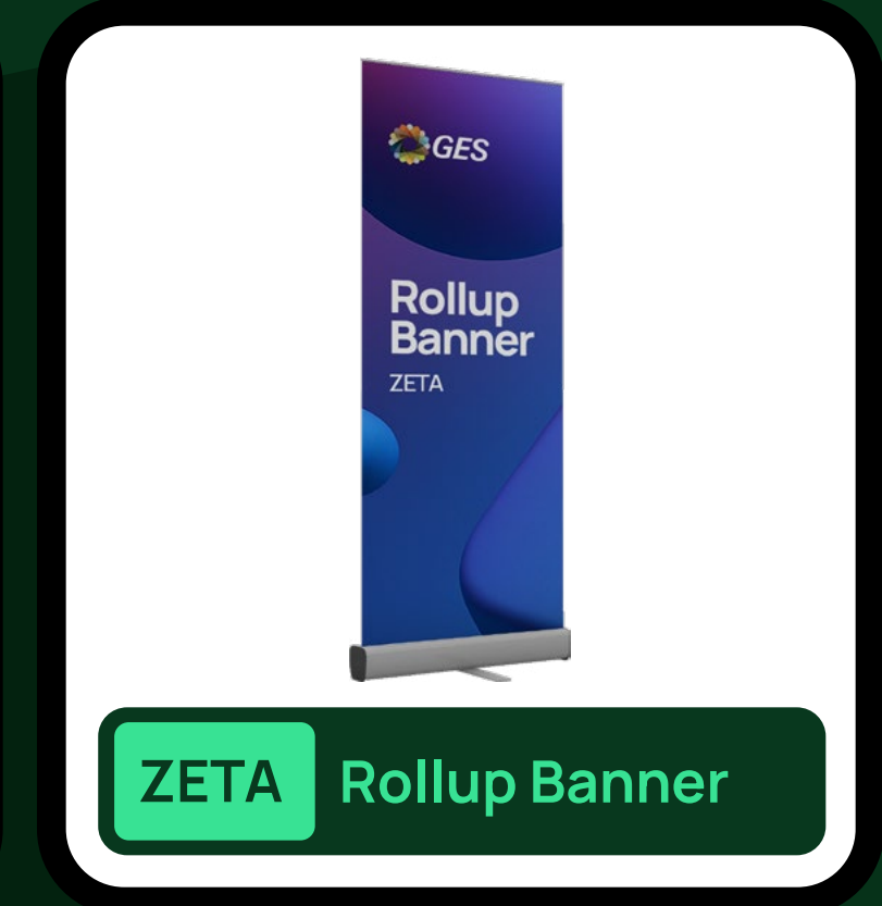
ZETA Rollup Banner

All items printed to order – yours to keep.