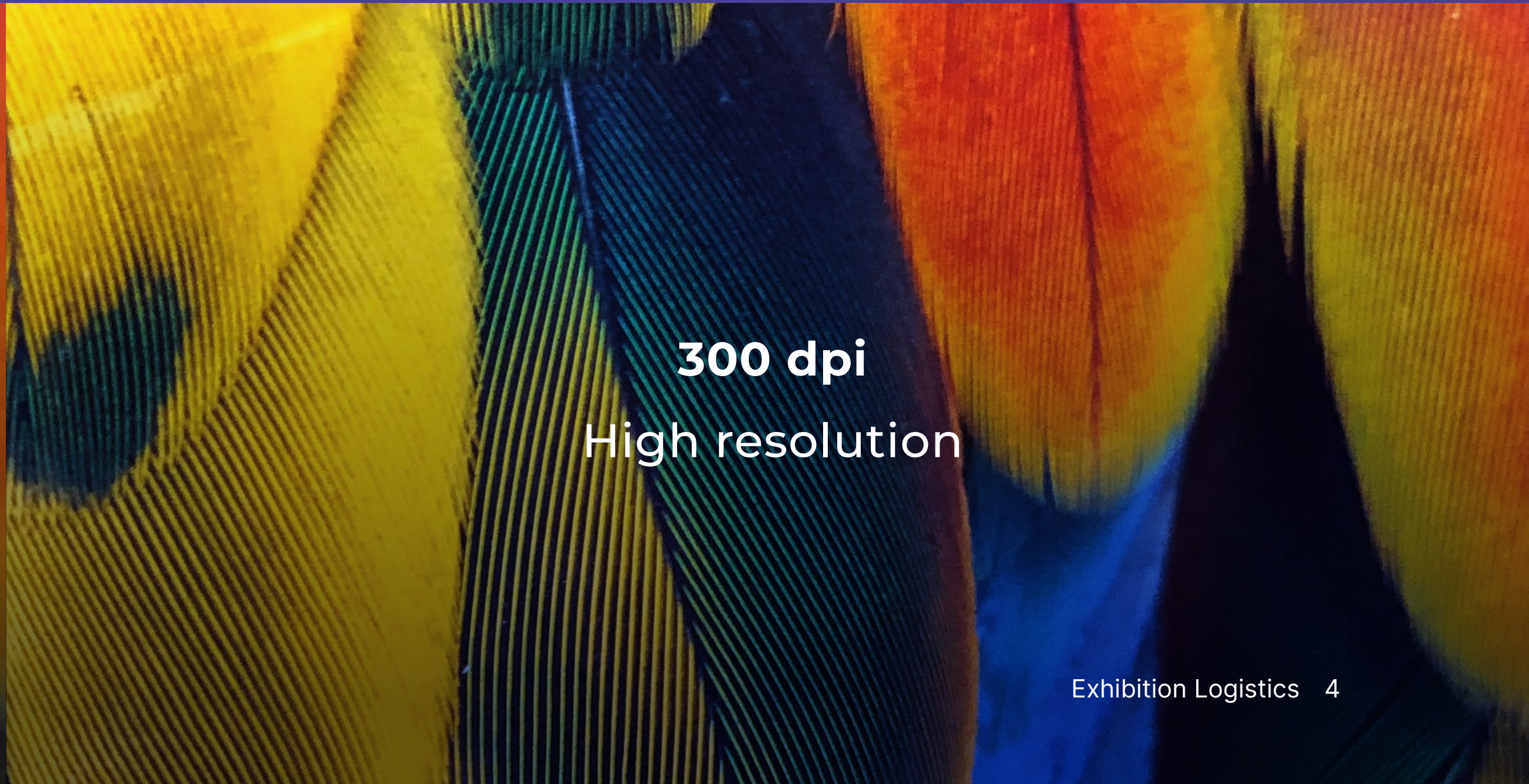
300 dpi High resolution