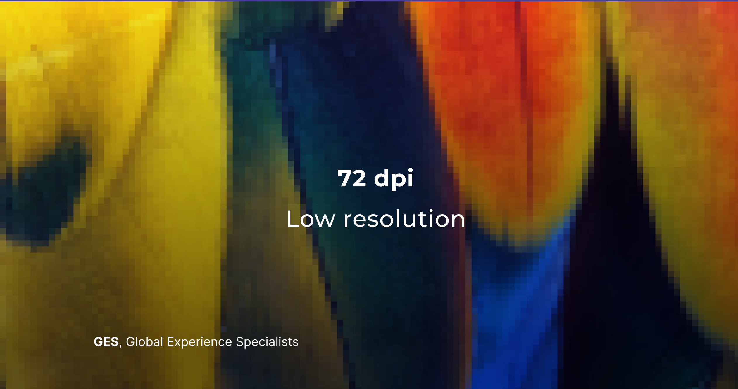
72 dpi Low resolution

You can find the dpi of your image by looking at the properties of your file. Check out the example below to see the difference between high and low resolution images.